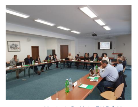
Meeting in Probistip, F.Y.R.O.M.

Both were focused on managerial/financial aspects of the project but, mainly, on the ACUs technology, positioning and tendering processes.