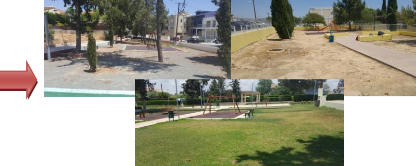
Photos from the 3 Parks that we will install the ACUs for the citizen