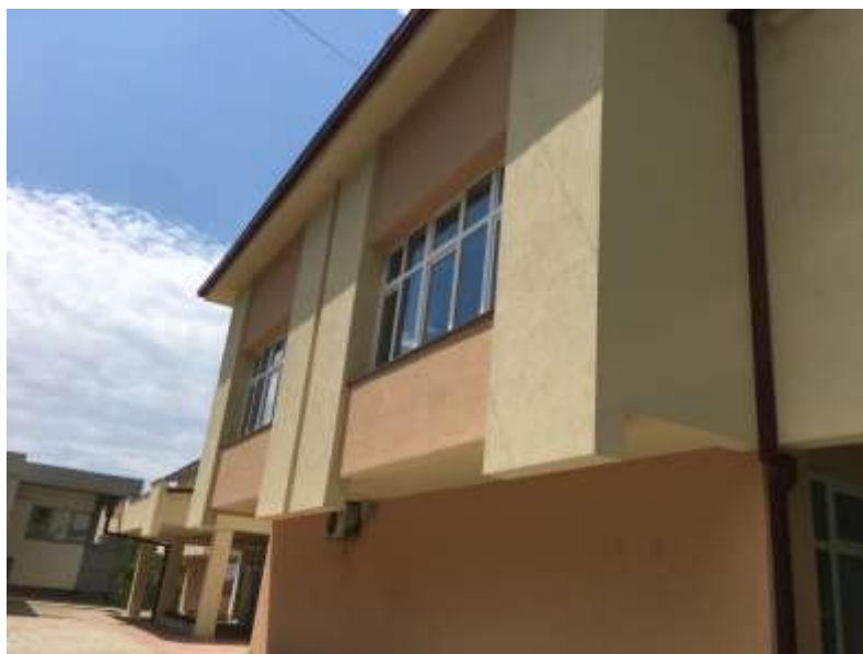
Good practices in energy efficiency and environment protection Common seminar in Rila